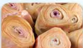
Artichoke Whole Hearts