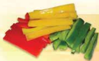
SLICED BELL PEPPER