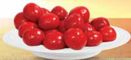
BABY CHERRY PEPPER